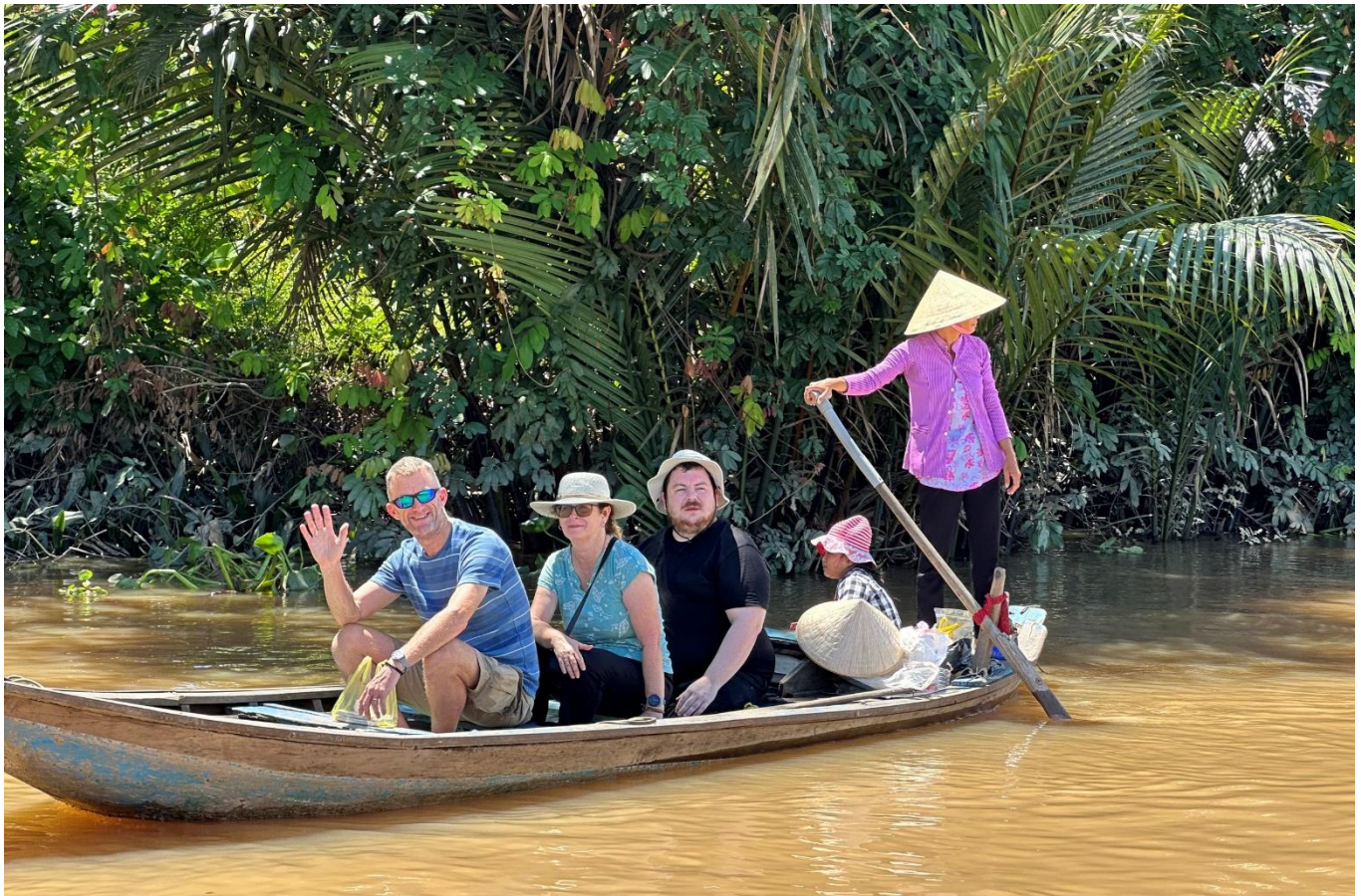
Boat Trip on Tien River

Start at Tourist Boat Station (My Tho) , cruising on Tien (Mekong) river and seeing four islands: Dragon, Unicorn, Tortoise, Phoenix . Enjoy fresh coconut juice. Stop at Thoi Son Island , go walking around countryside road, seeing orchards, enjoy tropical fruits and listen to traditional music. Take a rowing boat on small canal with beautiful scenery of country side, to visit honey-bee farm and enjoy honey-tea. Stop at Phoenix Island to visit Coconut Monk Temple and Crocodile-pond . Lunch at a local restaurant. Driver back to Saigon. Visit Vinh Trang Pagoda en-route.