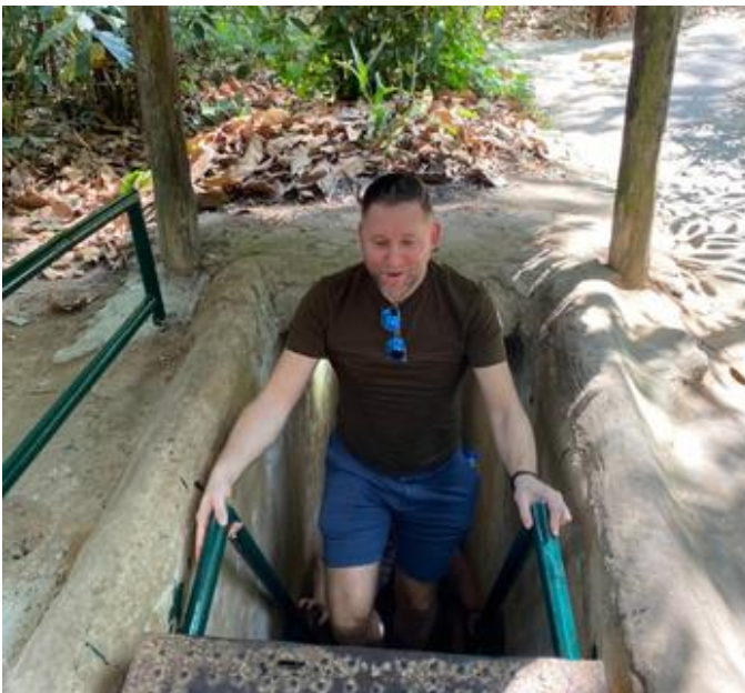
Cu Chi Tunnels

Transfer to Cuchi , passing paddy fields. Never discovered by America forces, these tunnels were an important Vietcong base during America War. Stretching over 200km, this incredible underground network, dug by hand out of hard laterite, connected commands posts, hospitals, shelter and weapon factories. Transfer back to Saigon, enjoy lunch, then you will visit the famous Saigon landmarks, the Cathedral of Notre Dame as well as the Centre Post Office and pass by the ornate City Hall (Hotel De Ville) and old Opera House . Visit The Unification Palace which formerly was Independence palace of the South Vietnamese President. Finally, end up at the centre Ben Thanh Market , where vendor display a vast of variety of traditional goods and handicrafts.