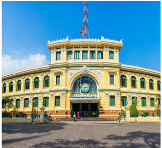
Centre Post Office